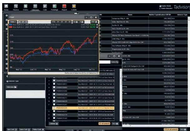
Tadvisory: quantitative and qualitative financial analysis